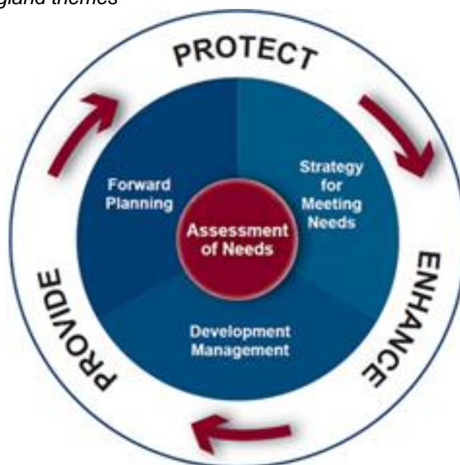
Figure 1: Sport England themes

To provide new playing pitches where there is current or future demand to do so.